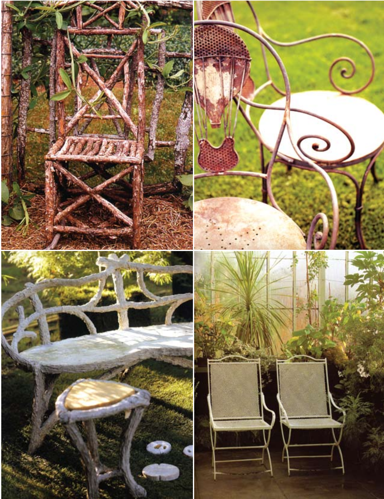
Nothing is more the child of art than a garden. —Sir Walter Scott