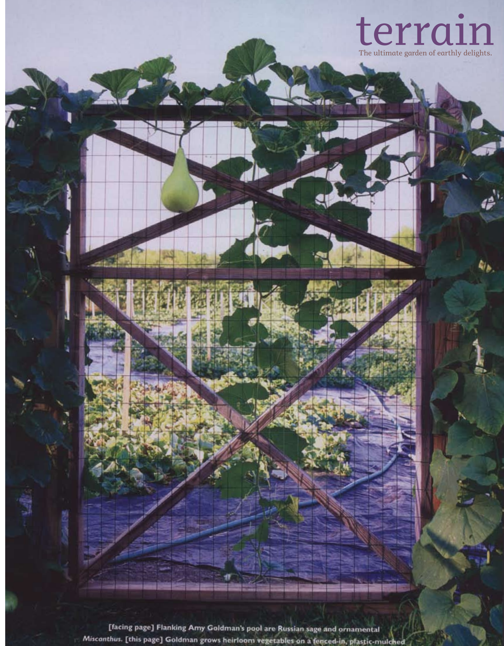
[facing page] Flanking Amy Goldman's pool are Russian sage and ornamental Miscanthus. [this page] Goldman grows heirloom vegetables on a fenced-in, plastic-mulched

The ultimate blossom garden of earthly delights. A fertile ground representing an extraordinary pollinate opportunity to branch out. To evolve in new directions, from multiply root systems to treetops and beyond. To introduce a wonderful new/old way of living that brings the outdoors in (and vice versa) unfurl .