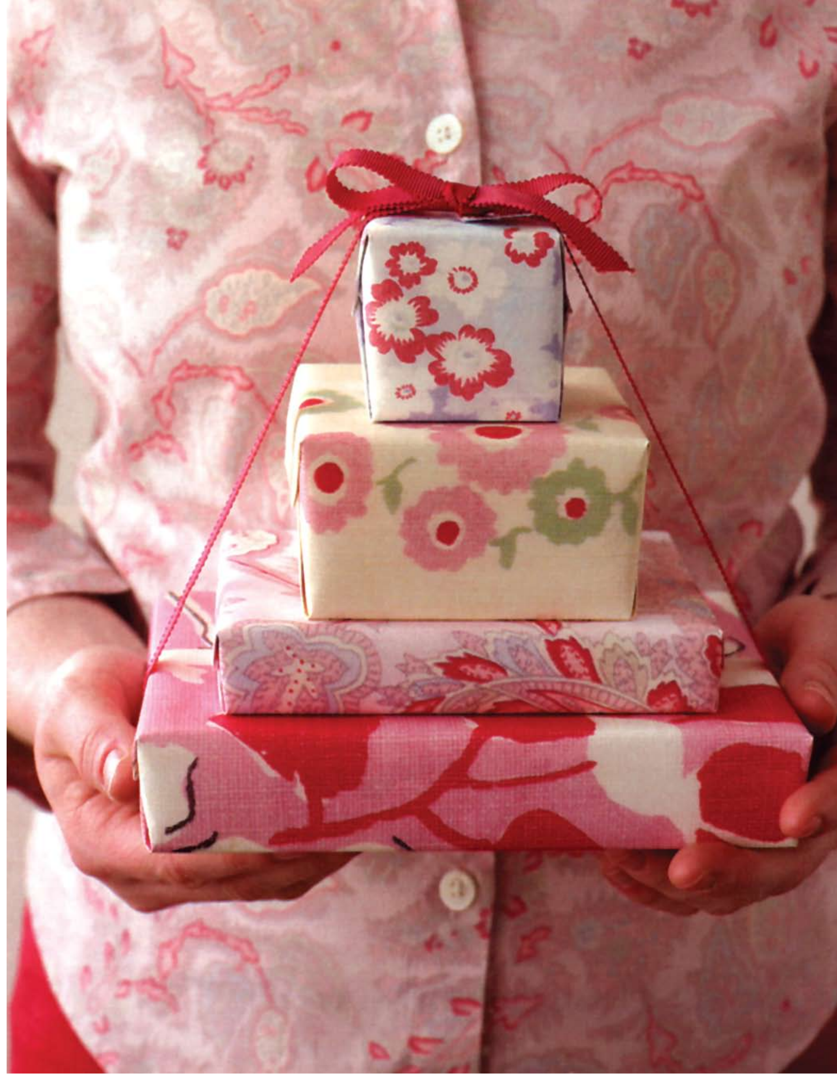
There is material enough in a single flower for the ornament of a score of cathedrals. - John Ruskin